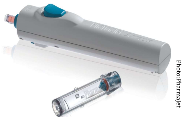
Fig. 1. Stratis SC/IM (0.5 ml fixed dose).

The study was conducted at six sites across India from September 2014 through December 2015. Eligible participants were healthy children aged 15–18 months who had received a measles vaccine at 9 months of age. Children with a past history of measles, mumps, or rubella infection; significant abnormality; any neoplasm or blood disorder; or a history of allergy to any of the vaccine components and those who had previously received the MMR vaccine were not eligible. After written informed consent from their parents, 5 ml blood was drawn for immunogenicity testing from eligible subjects, and the MMR vaccine was administered